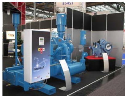
The P300 Air Compressor Package and the P300 cutaway airend model.

Total attendance figures were over 230,000 visitors which were up by more than 10 percent from 2005. Attendance from Germany was up 12%, while visitors from abroad were around 30%. The largest increase in foreign participation was from the Americas and Eastern Europe.