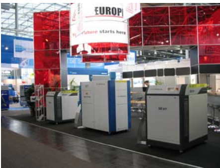
Three (3) newly developed oil-injected screw compressor packages from FuSheng..

The Hannover Fair more than lived up to the reputation as the world's leading technology event once again this year. Representatives from major industrial sectors were in attendance. Some of the core themes included energy technologies; industrial automation; power transmission; and cutting-edge Research and Development. Energy efficiency was well represented in many areas of the show. The exhibitors incorporated the efficient use of energy into their displays. In addition, special energy efficiency displays were put on view throughout the show.