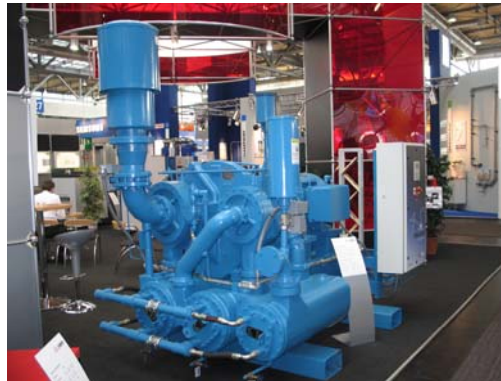
The Polaris P300 Centrifugal Air Compressor Package display received attention from many visitors from all around the world.

TectoYouth was a new education and information program that was designed to get young people eager to learn about technology. In the very first year, this joint initiative proved to be very successful. Many school children throughout