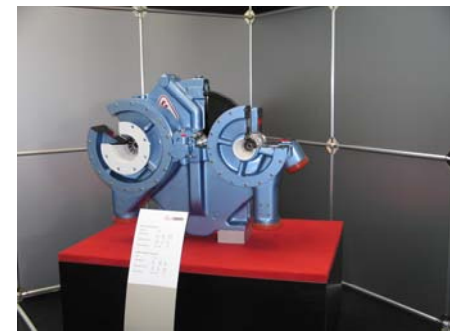
The P300 Cut-away airend model was one of our products on display at the show.

FS-EUROPE had on display the Polaris P300 Centrifugal Air Compressor package and the P300 Airend cut-away. In addition to these products, there were three (3) new developed oil-injected screw compressor packages on display representing FuSheng. All of the products represented received much attention from visitors all around the world.