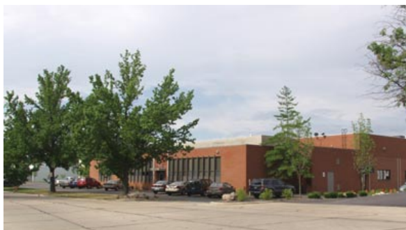
HTE Technologies new 52,000 sq. ft. headquarters facility is located in St. Louis, Missouri. This new facility is equipped with a state of the art multi-media training room, a product demonstration room, and 3,000 sq. ft. Repair bays and test center for compressor, dryer, and other pneumatic products. HTE can run air compressors up to 500 horsepower.

HTE has been very successful in promoting FS-Elliott compressors to Ameren Energy. Five (5) P-300 units have been sold to date with more orders expected.